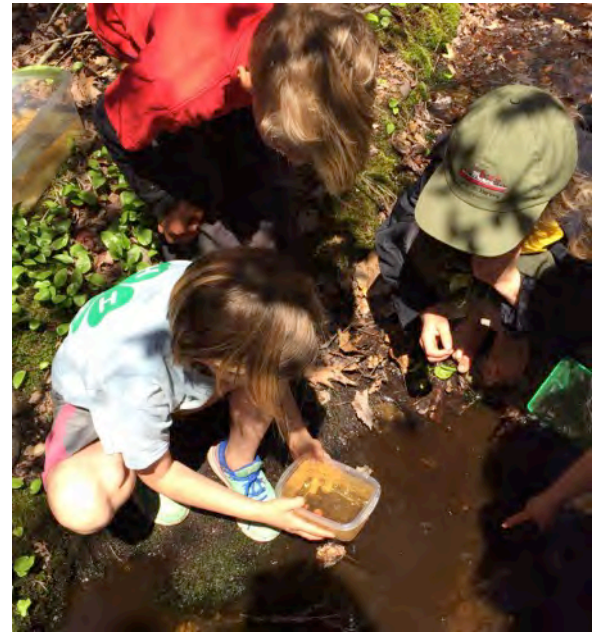
A group of children examining tadpoles during a vernal pool exploration along the Homestead Trail.

With offices in Ellsworth and Portland, the Maine Community Foundation works with donors and other partners to improve the quality of life for all Maine people. To learn more about the foundation, visit www.mainecef.org