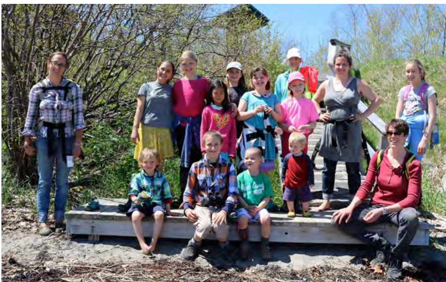
The Belfast Area Homeschool Group visited the island for an education program in May.

➔ Go to http://bit.ly/2wad5OD for a tutorial on how to get started.