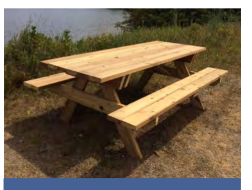
New picnic table made by Jim Freeman