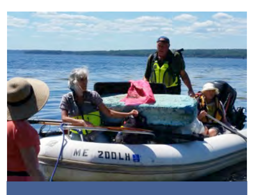
Pen Bay Stewards beach clean-up day